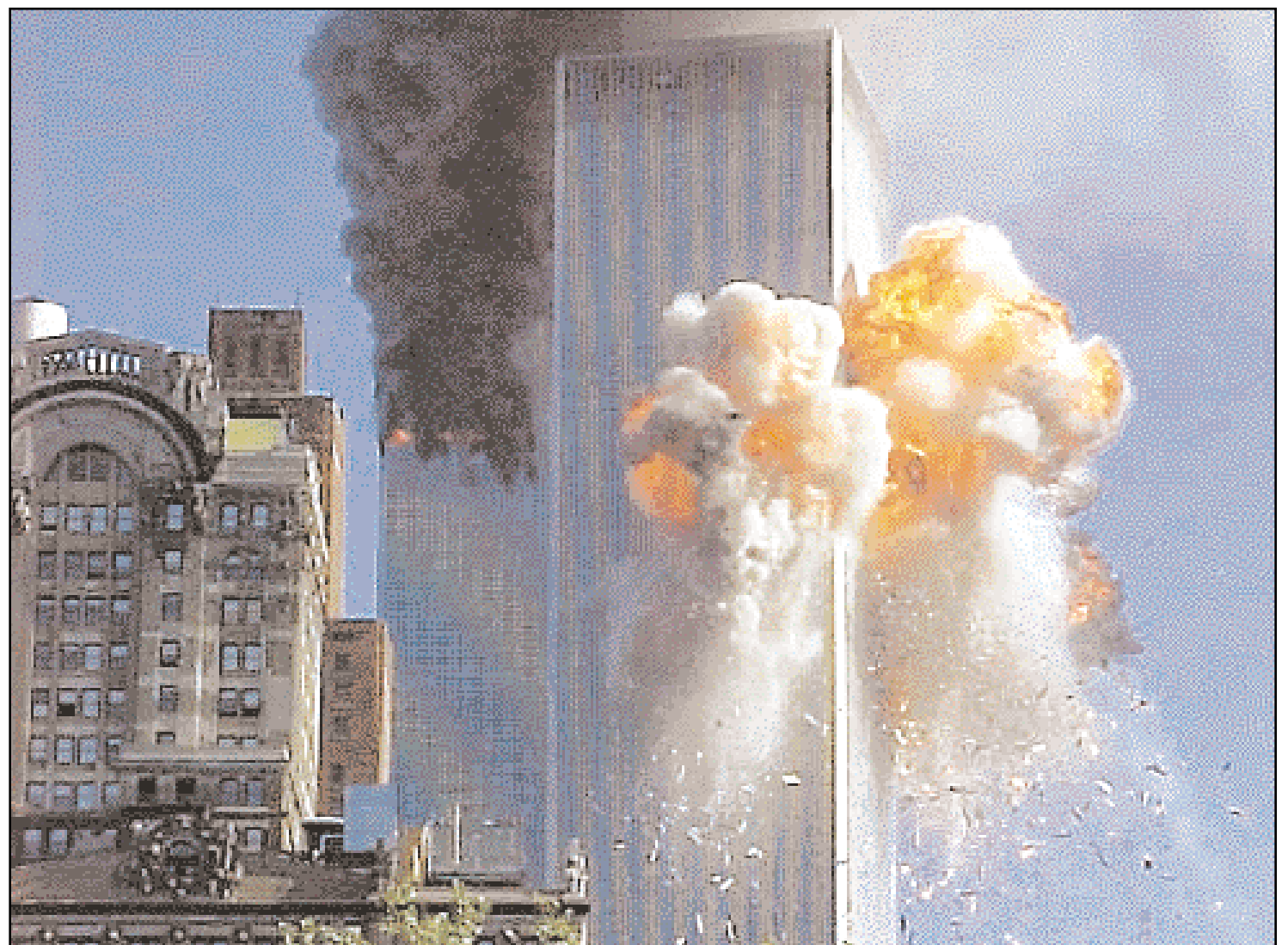
MOMENTS AFTER: A fireball explodes from the south tower after the United jet airliner crashes into the building. The tower collapsed around 10 a.m.

S tunned Americans grieved for the thousands killed Tuesday in the deadliest terrorist attack in history and drew a collective breath as they evoked memories of Pearl Harbor. Much of the government closed and air travel was shut down, along with the financial markets. Americans sought news of missing loved ones, gathered in prayer, donated blood and worried about the safety of our cities and our skies. And there were so many questions. Who did this, and why? How could it have happened? How will America respond?